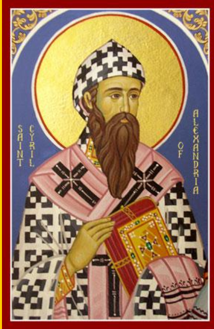
St. Cyril of Alexandria, June 9 th